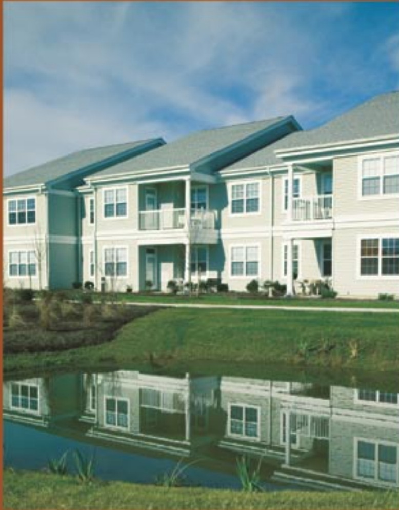
(left) Londonderry Apartments, Easton (below) Waterside Townhomes, Cambridge (bottom left) Park View Apartments, Easton (bottom middle) Magnolia Meadows Apartments, Easton (bottom right) Easton Club Townhouses, Easton