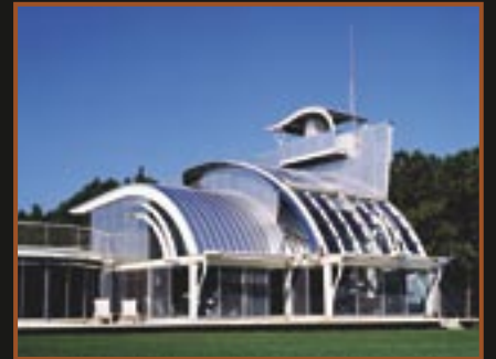
(top) Morgan's Point, Oxford (above) Riverside Manor, Trappe (above left) Benoni Point Residence, Bellevue (front cover) Hudson Creek Residence, Hudson