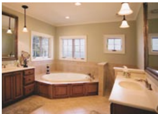
(above) Kitchen, Morgan's Point, Oxford (above left) Kitchen, Porter's Creek, St. Michaels (above right) Master Bath, Morgan's Point, Oxford (left) Master Bath, Porter's Creek, St. Michaels