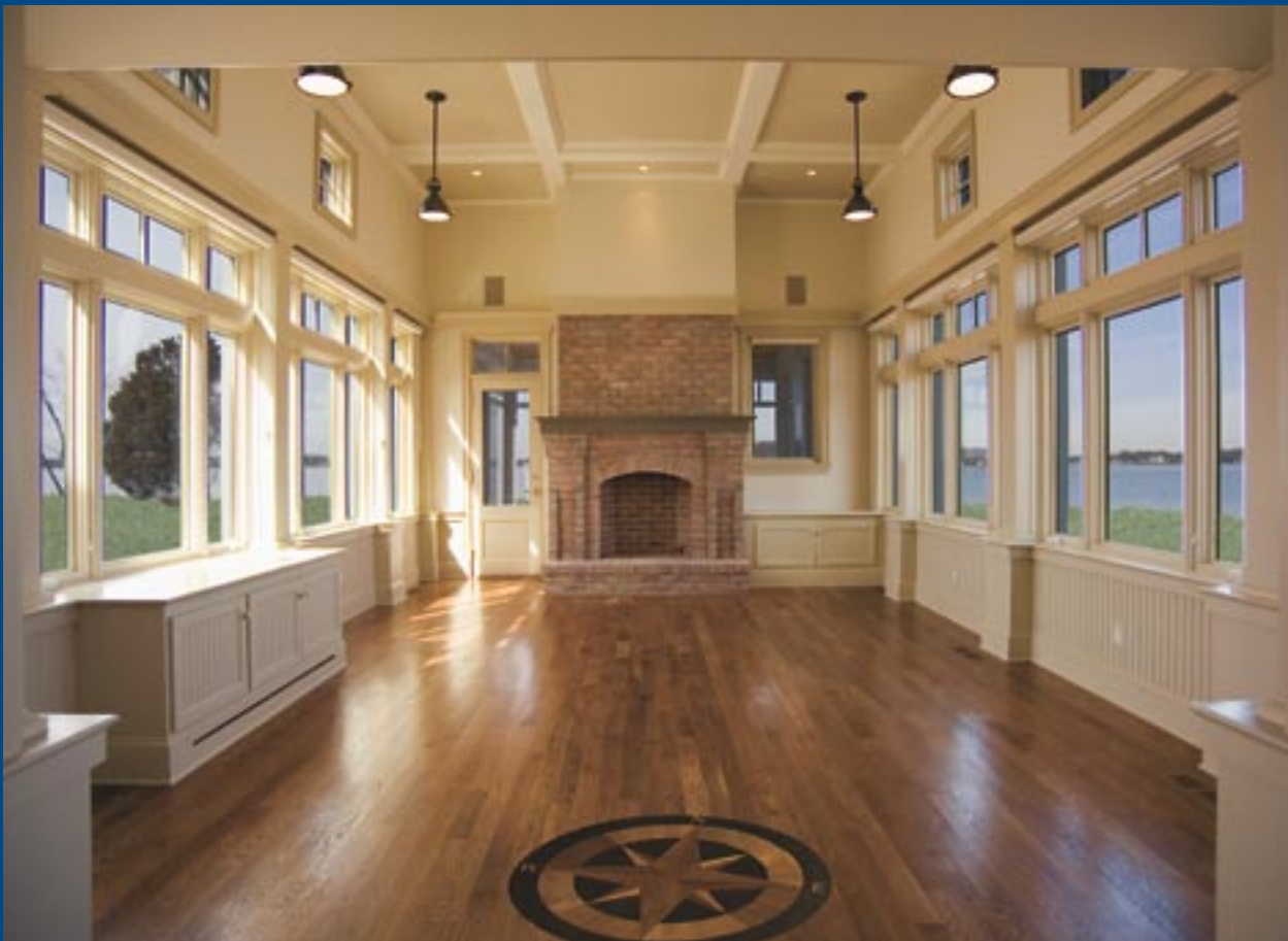
(above) River Room, Morgan's Point, Oxford